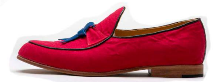
Style #43: Joseph Loafer (Red Wrinkled Canvas)