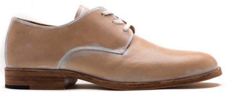
Style #34: Hobo (Artisan Natural Vachetta w/ White Painted Detail)