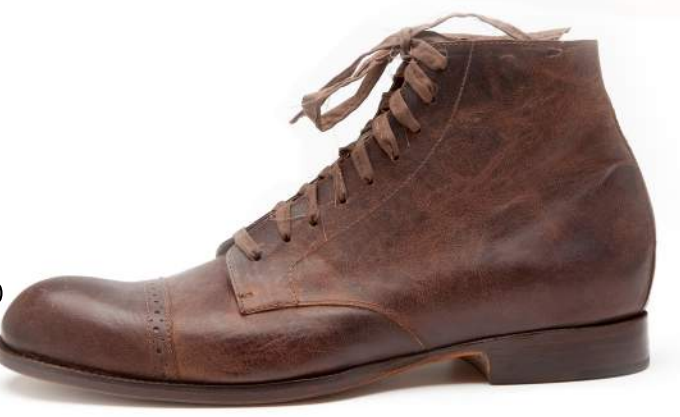
Style #52: Vern (Brown Waxed Leather)