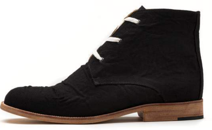
Style #46: Waris (Black Wrinkled Denim)