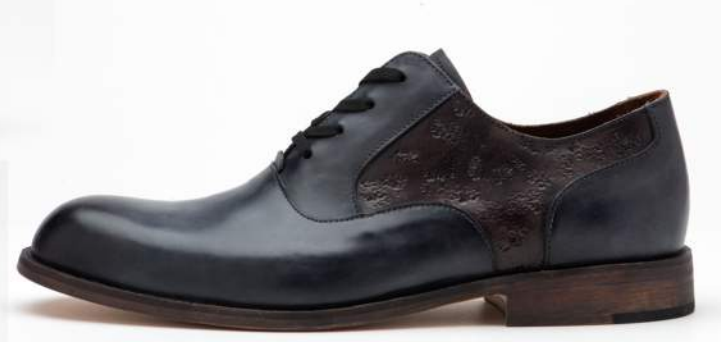
Style #2: Lonevog (Artisan Hand Painted Vachetta Grey w/ Hand Tooled Mid-Panel)