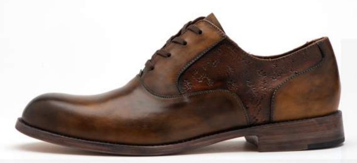
Style #1: Lonevog (Artisan Hand Painted Vachetta Brown w/ Hand Tooled Mid-Panel)