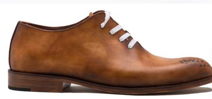
Style #5: Medallion (Artisan Hand Painted Vachetta Tan w/ Painted Medallion)