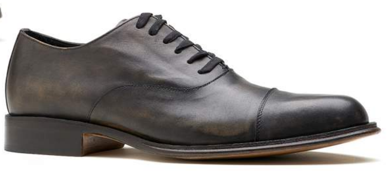
Style #27: Captoe (Hand Painted Vachetta Dark Grey)