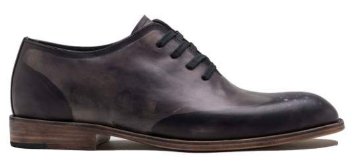
Style #4: Wingtip (Artisan Hand Painted Vachetta Grey & Black)