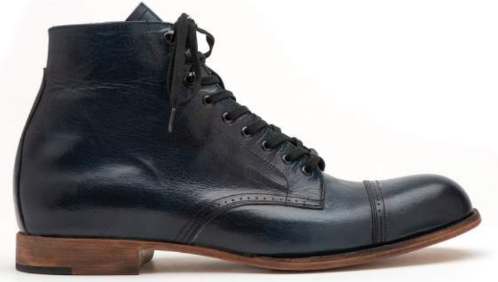
Style #48: Vern (Navy Milano)