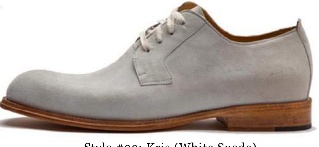
Style #29: Kris (White Suede)