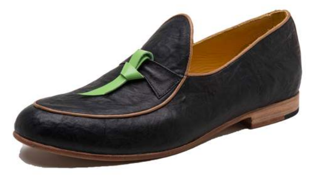
Style #42: Joseph Loafer (Black Borelo)