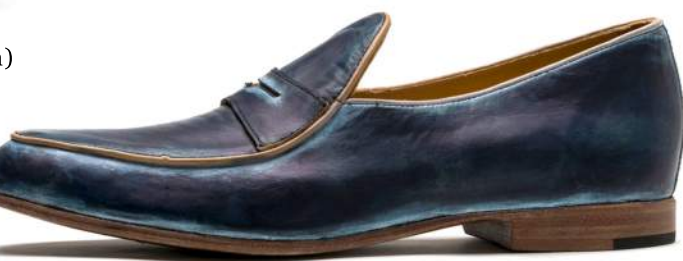
Style #40: Joseph Loafer (Hand Painted Vachetta Blue w/ White Detail)