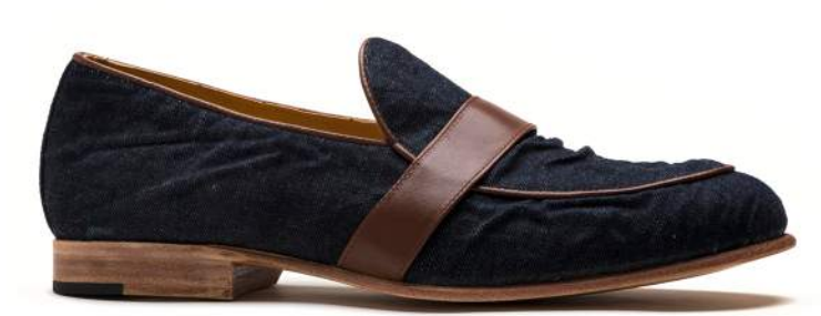
Style #44: Portofino Loafer (Wrinkled Denim w/ Brown Leather Strap)