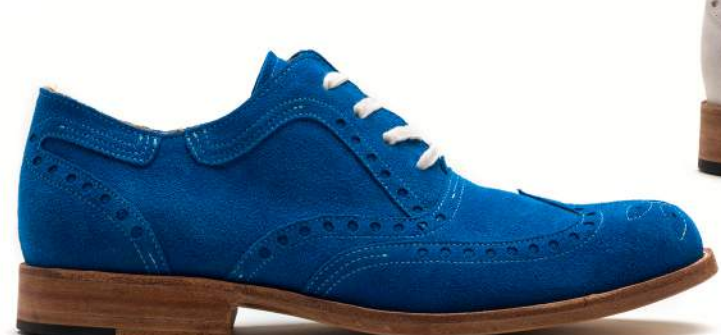
Style #17: Vanas (Blue Suede)