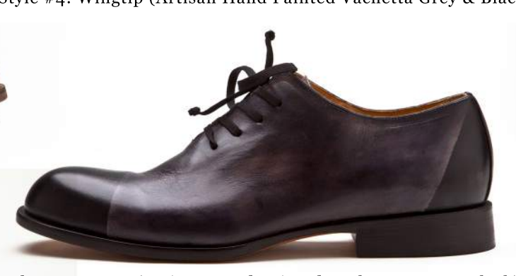
Style #6: Captoe (Artisan Hand Painted Vachetta Grey & Black)