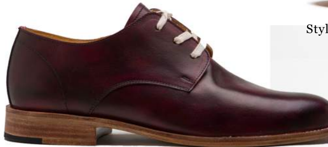
Style #37: Hobo (Artisan Hand Painted Vachetta Burgundy)