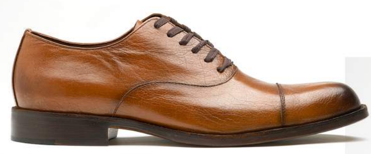
Style #24: Captoe (Cognac Kasur)