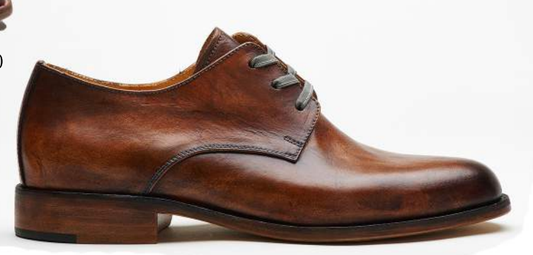
Style #38: Hobo (Artisan Hand Painted Vachetta Cognac)