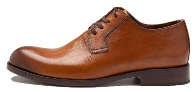
Style #30: Kris (Cognac Kasur)