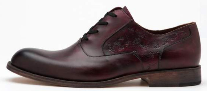
Style #3: Lonevog (Artisan Hand Painted Vachetta Burgundy w/ Hand Tooled Mid-Panel)