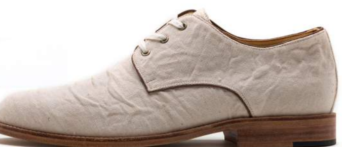
Style #36: Hobo (Wrinkled Off-White Canvas w/ Brown Piping)