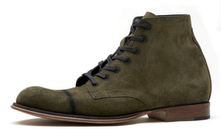
Style #51: Vern Painted Captoe (Olive Suede w/ Hand Painted Detail)