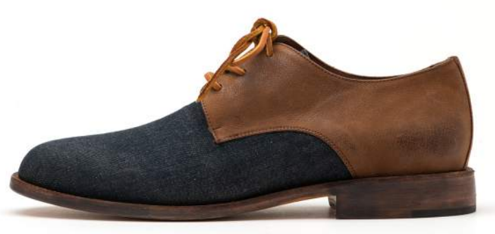
Style #32: Hobo (Waxed Denim/Brandy Jurassic Leather)