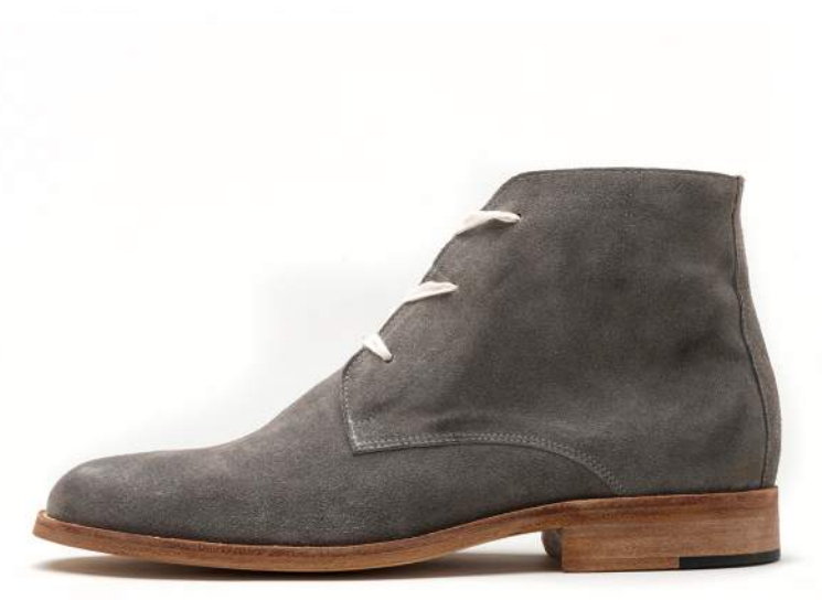
Style #47: Waris (Light Grey Suede)