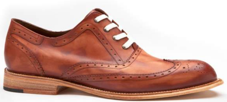
Style #20: Davis (Brown Boston)