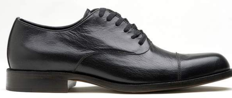
Style #26: Captoe (Black Kasur)