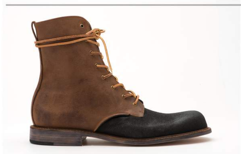
Style #53: Hunter (Waxed Black Denim/Brandy Jurassic Leather)