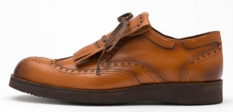
Style #23: Vanas Wedge (Light Brown French Calf) *with removeable kilty