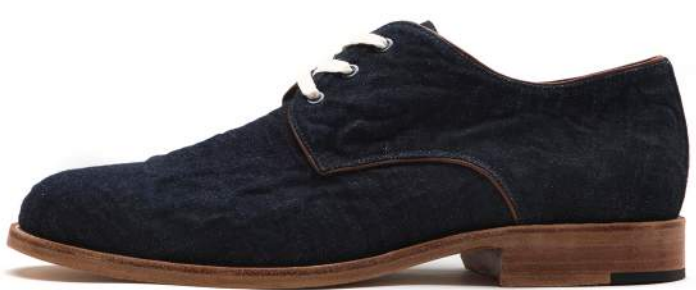
Style #35: Hobo (Wrinkled Denim/Brown Piping)