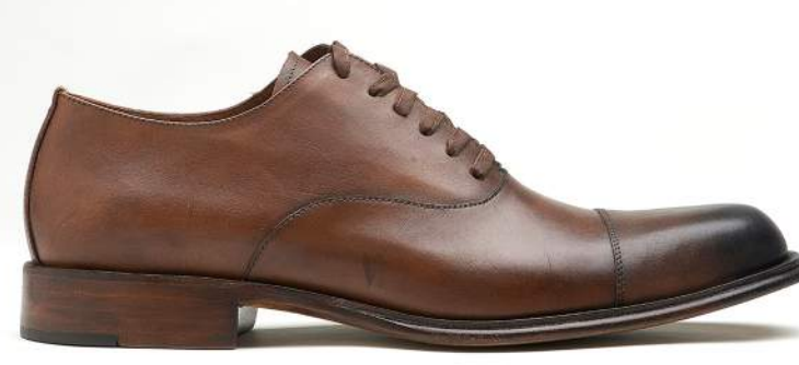
Style #28: Captoe (Hand Painted Vachetta Brown)