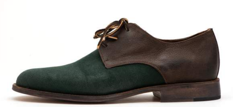
Style #33: Hobo (Waxed Green Canvas/Chocolate Jurassic Leather)