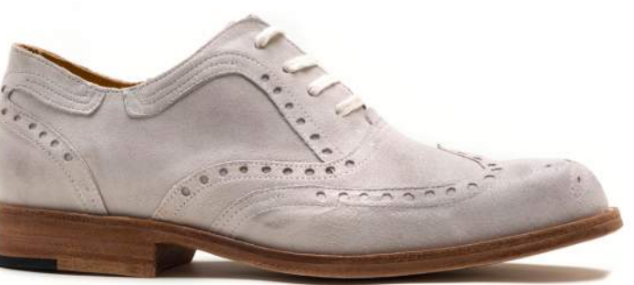
Style #16: Vanas (White Suede)