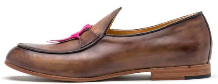
Style #39: Joseph Loafer (Hand Painted Vachetta Light Brown)