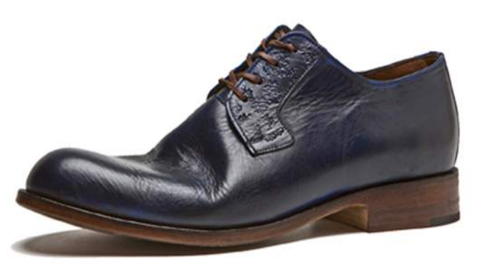
Style #31: Kris (Artisan Hand Painted Vachetta Navy Blue w/ Hand-Tooled Eyerow)