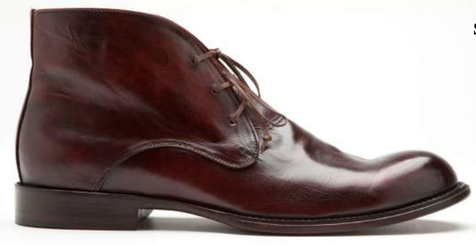
Style #7: Gaston (Artisan Hand Painted Vachetta Burgundy)