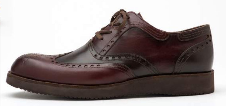
Style #22: Vanas Wedge (Burgundy & Dark Brown French Calf)