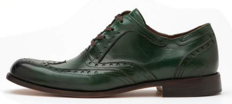
Style #18: Vanas (Green Milano)