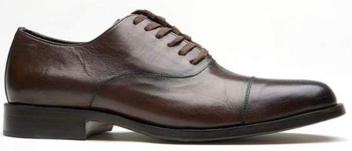
Style #25: Captoe (Black Cherry Milano)