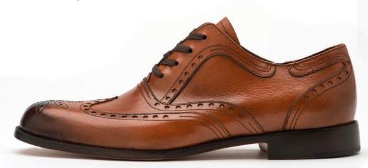
Style #19: Vanas (Cognac Milano)