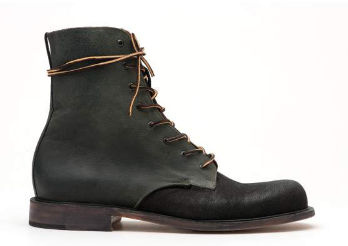
Style #54: Hunter (Waxed Black Denim/Black-Olive Jurassic Leather)