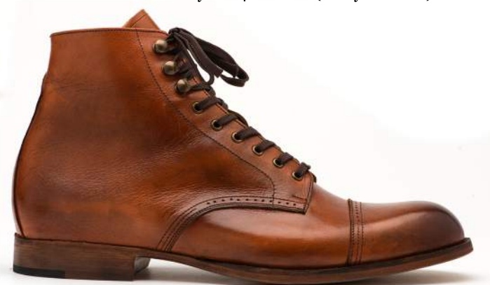
Style #50: Vern (Cognac Milano)