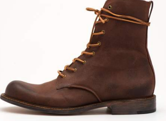
Style #55: Hunter (Tiger Jurassic Leather)