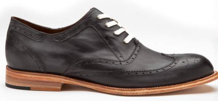
Style #21: Davis (Black Boston)