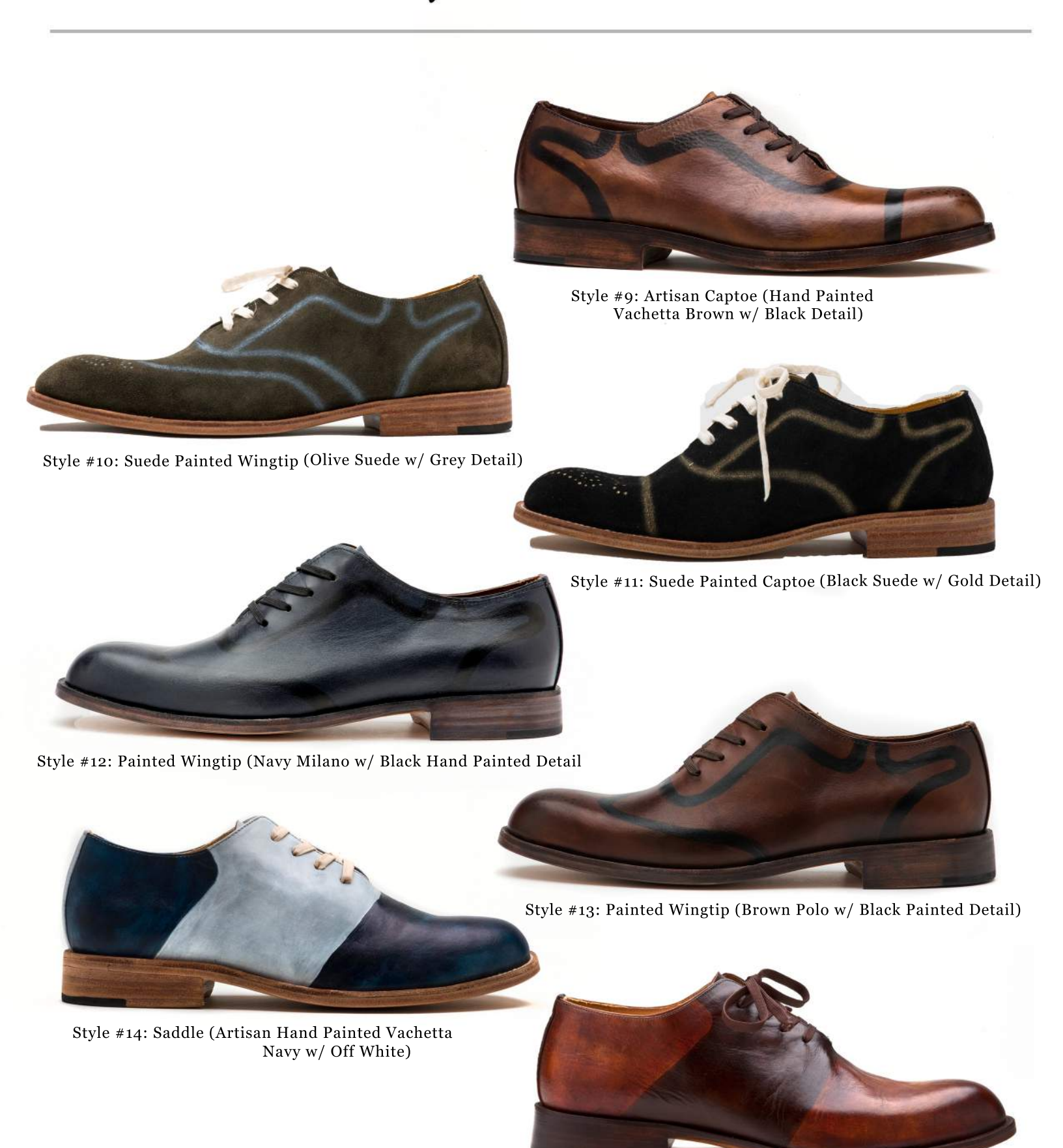
Style #15: Saddle (Artisan Hand Painted Vachetta Cognac w/ Dark Brown)