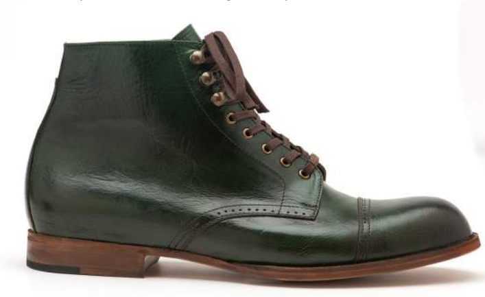
Style #49: Vern (Green Milano)